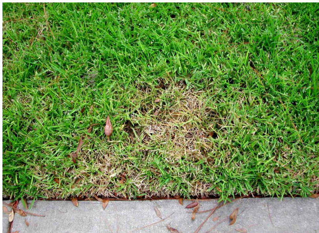
Figure 2. Patch of St. Augustinegrass killed by southern chinch bugs.

stolons of grasses with their needle-like mouthparts. This causes the grass to turn yellow and die. The insects tend to feed in groups, so dead patches of grass appear and seem to get larger as the chinch bugs spread through the grass (Figure 3). Southern chinch bugs mainly walk and rarely fly.