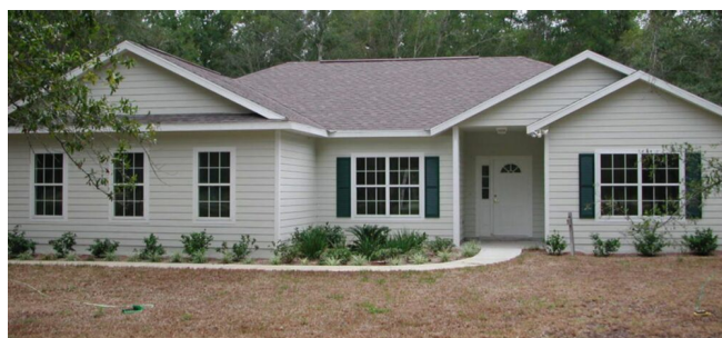
Figure 3. St. Augustinegrass yard killed by southern chinch bugs.