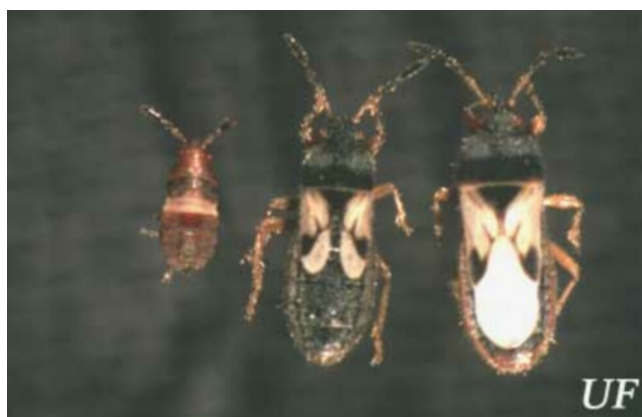
Figure 1. Nymph (left), short-winged (center) and long-winged (right) adult forms of the southern chinch bug.

Tiny eggs are laid singly or a few at a time in leaf sheaths, soft soil, or other protected areas. The eggs are white when first laid and turn bright orange just before hatching. Depending on climate conditions, eggs hatch in about 10 days and nymphs mature in about 3 weeks. Young nymphs are reddish-orange with a white band across the back, darken in color as