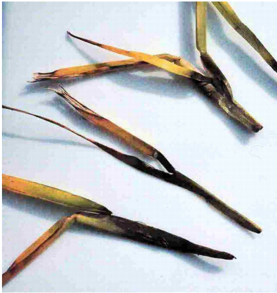
Figure 1. Base of leaf is rotted due to brown patch.