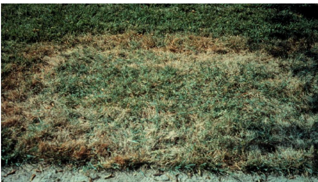
Figure 3. Brown patch symptoms on zoysiagrass. Note that the outer edge is a darker color indicating the fungus is active at this point.

Chemical Controls: Azoxystrobin, chlorothalonil, fenarimol, fludioxonil, flutolanil, iprodione, Junction ® , mancozeb, metconazole, myclobutanil, polyoxin D, propiconazole,