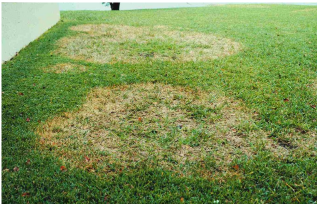
Figure 2. Brown patch symptoms on St. Augustine grass.